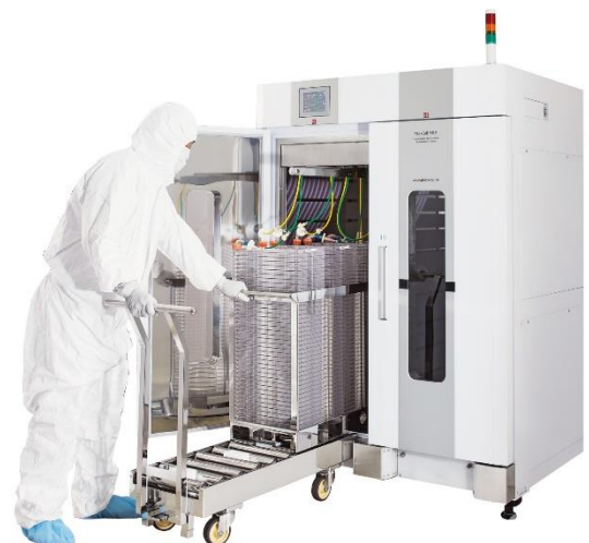
Completely compatible with dedicated incubators(MaxCell MLF2)