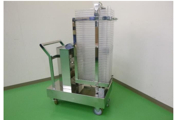
Hand manipulator loaded with 40 layer Cell factory