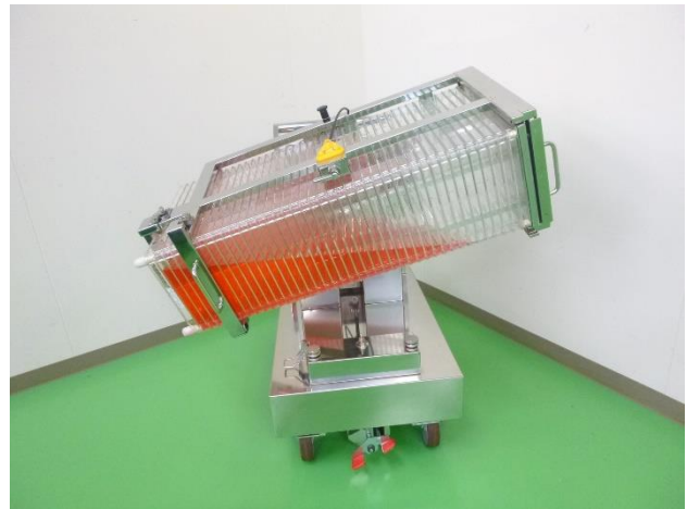
Culture media disposing position