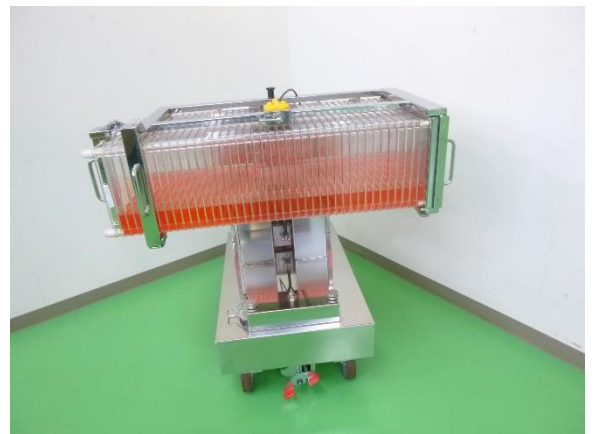
Equalization position after filling of culture media