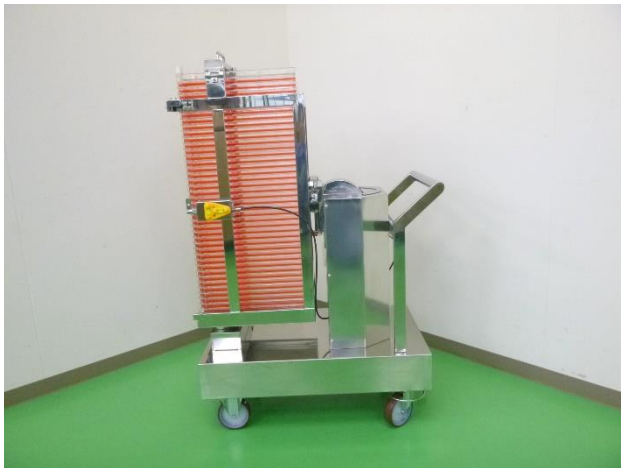
Designed for maximum operability and reliability