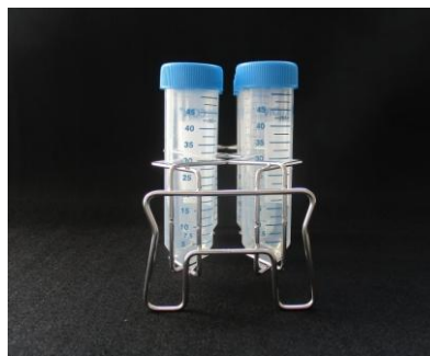
Proper intervals between tubes.