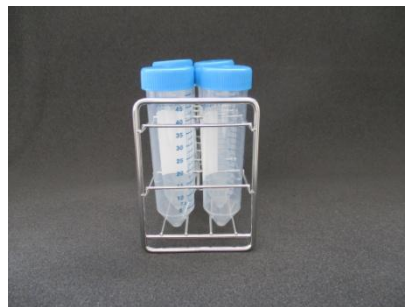
Tube caps conflict next ones