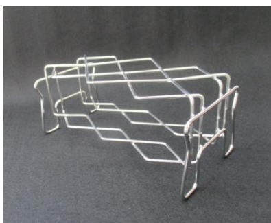
Design without burr.