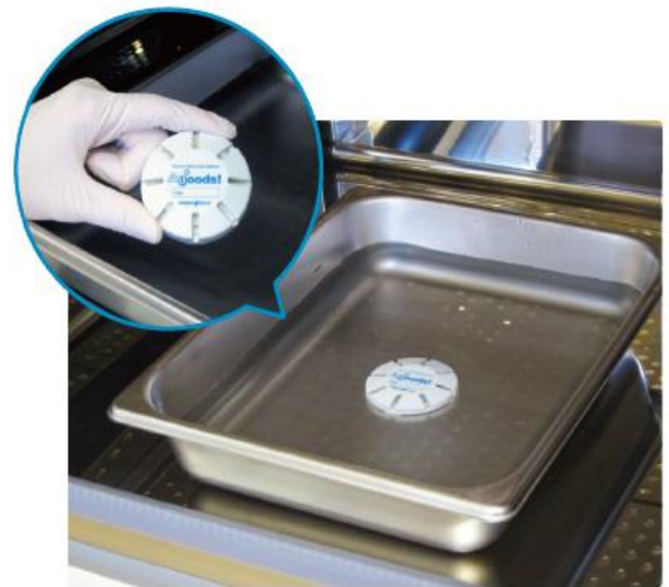
Example use in a CO 2 incubator